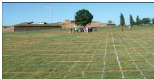
Living American Flag Grid Layout

The 25th Annual Living American Flag Program will be held Tuesday, May 20, 2008 at Fort McHenry National Monument and Historic Shrine from 9 a.m. until 12 noon. Schools must register, but the community is absolutely welcomed to witness this event!