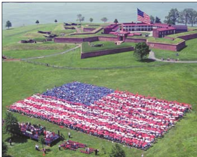
The Moment - The Living American Flag, Fort McHenry National Monument and Historic Shrine • Baltimore, MD