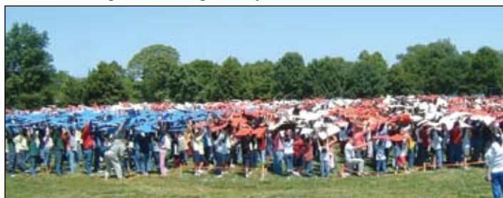
Waiting for the moment...

Through LAF Committee and teacher feedback, pieces of the program have been augmented