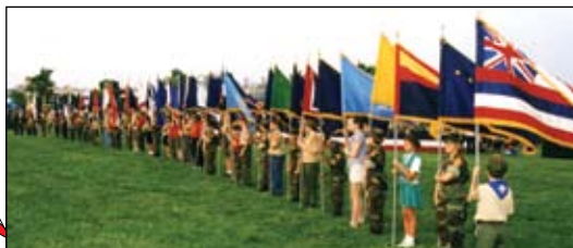
Parade of State Flags