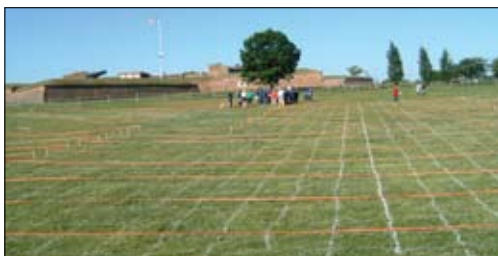
Living American Flag Grid Layout

The 25th Annual Living American Flag Program will be held Tuesday, May 20, 2008 at Fort McHenry National Monument and Historic Shrine from 9 a.m. until 12 noon. Schools must register, but the community is absolutely welcomed to witness this event!