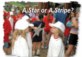
A Star or A Stripe?

Those words were heard all over the Deep Creek Lake area in Garrett County in the McHenry community after Flag Day last year. They had just completed their inaugural "Flag on Mountain Maryland" at the Wisp, which drew hundreds of people and participants to honor the symbol of our nation's past, present, and future. That future was on display as approximately 200 children, along with several adult leaders, formed a "living flag" that rippled down Marsh Mountain as the group walked down the hill, and the Garrett Community Concert Band played "Stars and Stripes Forever."