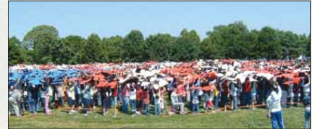
Waiting for the moment...