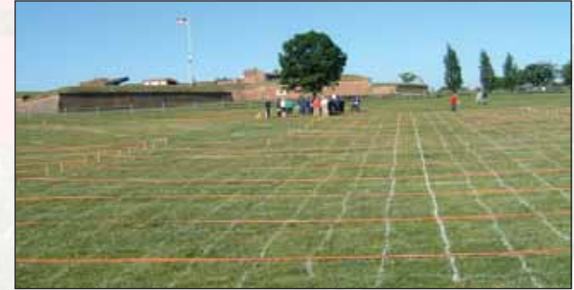
Living American Flag Grid Layout