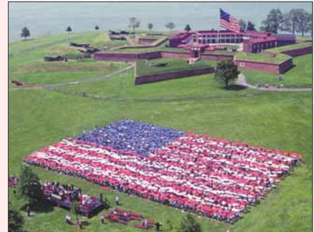
Living American Flag, Fort McHenry National Monument and Historic Shrine • Baltimore, MD