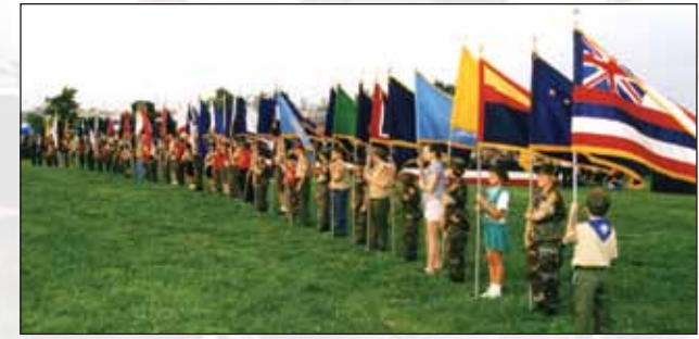
Parade of State Flags