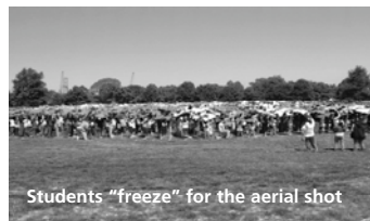
Students “freeze” for the aerial shot

The event was chaired by D o m i n i c “ M i c k e y ” M e z z a n o t t e , S r . , with B o b D e l i s l e